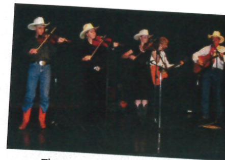
The Carr family raises Angus cattle and plays western music.